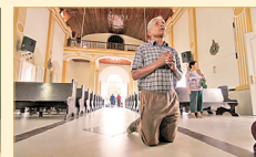
Interior of the Shrine