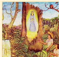
Representation of the apparition of the little statue of the Virgin surrounded by a glowing light from the trunk of the tree