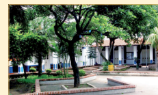
Internal courtyard of the Shrine