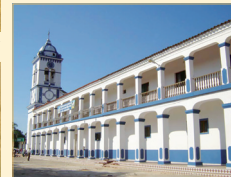
Facades of the multi-colored Shrine