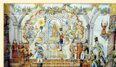
The Shrine is adorned with precious majolica (glazed earthenware pottery) upon which the story of the Shrine is illustrated