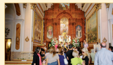
Inside of the Shrine