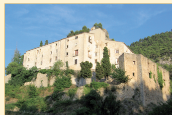
The Shrine sits on top of the remains of an ancient castle