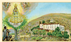
Representation of the apparition