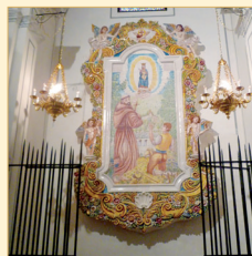
Ceramic portrayal that illustrates the apparition of the Virgin to Tomás Gaspar