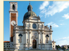
View of the Shrine