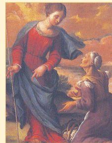
Painting which depicts the apparition

The Basilica Shrine is now composed of the combination of two churches: one of the Gothic style, completed in the second half of the 1400s; the other of the Baroque style, enlarged and completed by Carlo Borella (1688-1703), after the first extension based upon the design by Andrea Palladio (1576). The High Altar, with the highly venerated image of the Madonna, a statue sculpted in marble in 1430 and polychromatic, who under her mantle protects all the faithful who have recourse to her, is a masterpiece completed only in 1928. From the City of Vicenza one can access Monte Berico by using the walkway of stairs, a series of porticos, built in the second half of the 1700s, formed by 150 arches, as many as the beads of the Joyful, Sorrowful, and Glorious mysteries of the Rosary, and every tenth arch, from a Chapel in which are painted the single Mysteries of the Rosary. Officiated by the Servite Order, also known as the Servants of Mary, the Shrine of the Madonna of Monte Berico is an uninterrupted destination of pilgrimages.