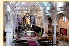
Interior of the Shrine