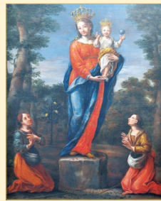
The message of the Virgin appears as a severe warning, however in her final words it contains also a message of hope. Mary puts at ease the two girls by showing concern for them and for their own needs. Their attitude is at once respectful, in this way begins the dialogue during which Mary will leave, in her message, a plan for the restoration and growth of Christian life: Eucharist, prayer and penance.

At these words the girls saw fresh blood flowing from the knees and the hands of the Lady. The Virgin continued to speak: "You too have seen the threatening flame that crossed the sky; you too have felt the earthquake that occurred on the day of Saint Anthony Abbot, you have observed the terrible thunderstorm that devastated meadows and roads, that uprooted plants and destroyed buildings and bridges. Also, Coira had to be totally destroyed. Proclaim that if the sinners will not repent, if the obligation of the holy days will not be observed better, if acts of prayer and penance will not be done, the anger of the Son of God will come down terribly to punish humanity. Say also that, following the practice of my devotees, all should resolve to keep Sunday holy from the Vespers of the Saturday, in my honor and that of my Son. Only after this He will grant my prayer to obtain for you salvation". Immediately afterwards, the Holy Virgin disappeared and on the place of the apparition a wooden chapel was built which was modified and enlarged over time.