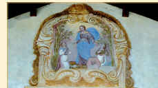
Fresco located on the facade of the Shrine