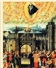
Exactly what the ailment of the Ardents was is unknown. From manuscripts it is deduced that it was a disease which "burned" and slowly consumed whomever was affected. Often they suffered an excruciating internal heat and were then brought into convulsions, delirium, blindness, and sometimes it was aggravated also by eruptions of pus from their skin. Still today it is wondered what kind of illness it could have been. Since this disease spread mostly during the periods of famine, some have ventured to guess that perhaps they suffered from ergotism (toxicosis due to several blight of the grain, which brings a sickness derived from the ingestion of bread produced from spoiled flour).