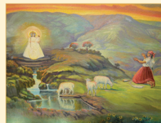
Representation of the apparition of the Virgin of Urkupiña to the shepherd girl