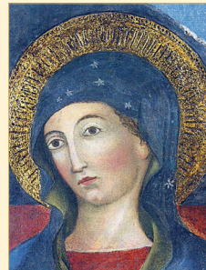
The Miraculous icon that cast into the well began to float on the waters despite being very heavy