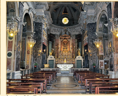
Interior of the Shrine