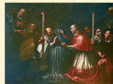
Painting depicting Cardinal Capocci who recovers the tile from the water

The next day the Cardinal went to the Pope, Alexander IV, to recount to him the incredible phenomenon. After the appropriate verifications, the event was recognized as supernatural, and it was decided to build (or perhaps rebuild) the present church around the miraculous well, and to venerate the reemerged image inside it. Still today, entering the church, immediately on the right, there is a chapel with an altar. There you find exposed the image of the Virgin Mary that floated, and right below it, a kind of small faucet, that allows the faithful who request it, to drink the water of the ancient well (see photo), as such water, drank devoutly in spirit of penance, appears to have brought many healings. Precisely for this motive not infrequently one sees not only people drinking this water, but also people filling a small bottle to take it to some sick relative. For this reason the church can be considered a little Lourdes.