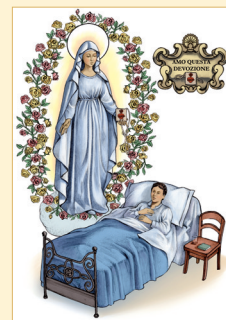
Depiction of the miraculous healing of the visionary

On the occasion of the seventh apparition, Our Lady said to her: "My Son Himself has also souls who are more fervent and devoted to Him. His Heart has so much love for my heart that He cannot refuse any of my requests. Through me He will touch the most hardened hearts."