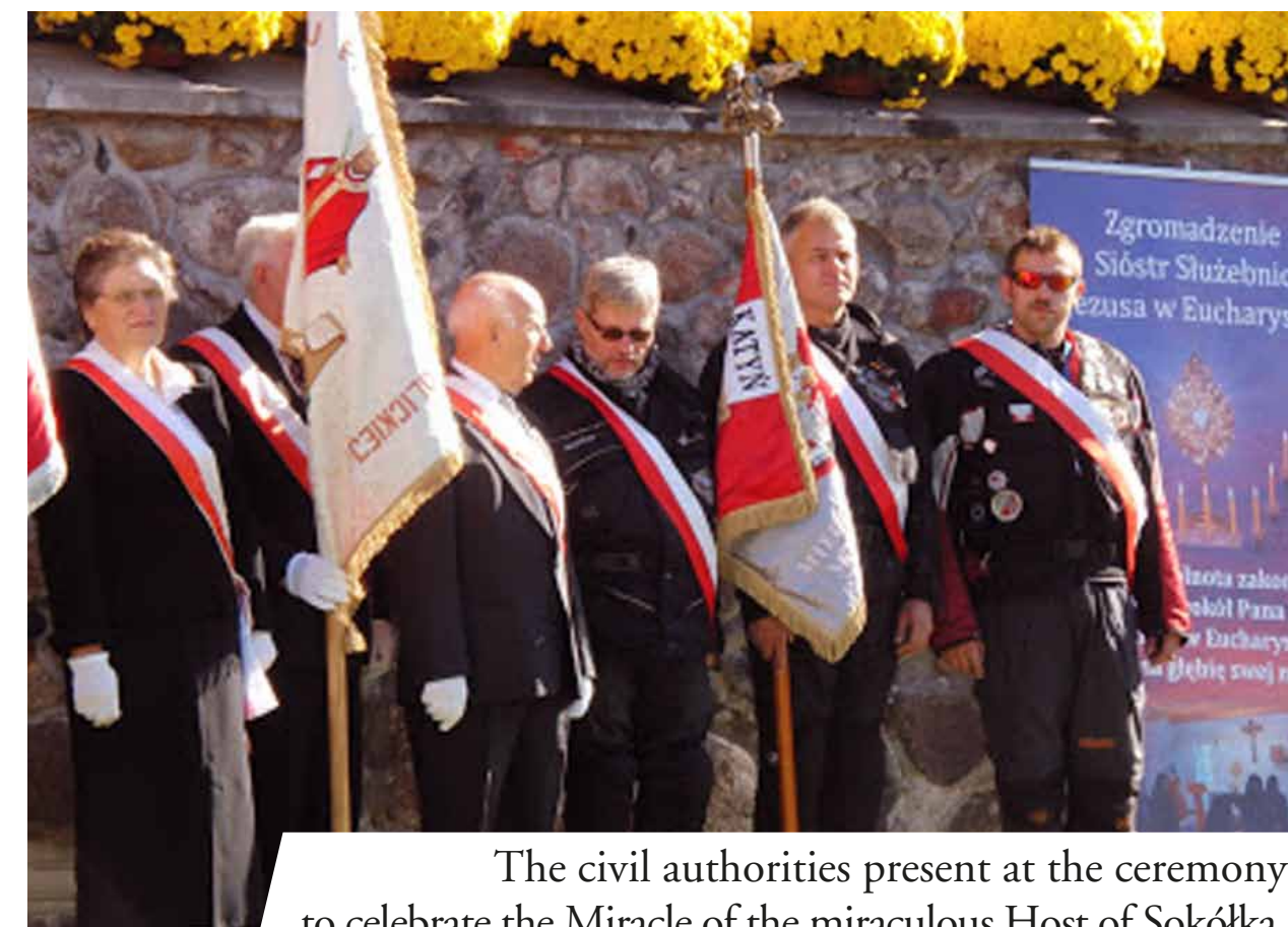
The civil authorities present at the ceremony to celebrate the Miracle of the miraculous Host of Sokółka.

And yet, several people, who not only have never analyzed the material but they had neither seen it with their own eyes, have affirmed that the red color of the Host is due to prodigiosin, a red pigment produced by the bacterium Serratia marcescens . “Obviously, this is absurd” affirmed the specialists of Białystok, also because the material observed corresponds to cardiac muscle and not to a bacterium. The scientists of Białystok have analyzed the sample taken in purely scientific terms and not fideistic. Several accusations were even more absurd, like the one put forth by the group of so-called “rationalists” according to whom the tissue analyzed pertained to a murdered man. The professors reacted with a statement in which they expressed “a profound indignation for the fact that the public opinion was led in error by false pseudoscientific hypotheses on the analyzed phenomenon, above all on the part of people who ignore the particulars relative to the analysis, who