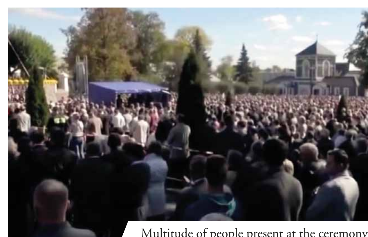
Multitude of people present at the ceremony