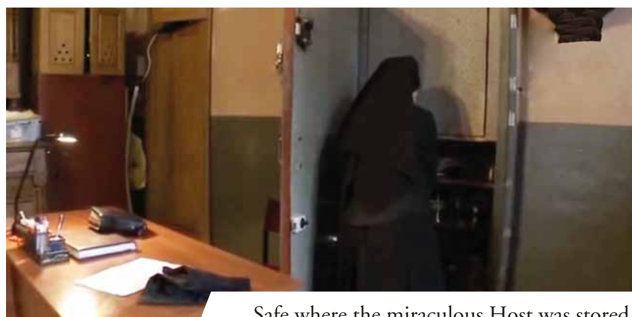
Safe where the miraculous Host was stored