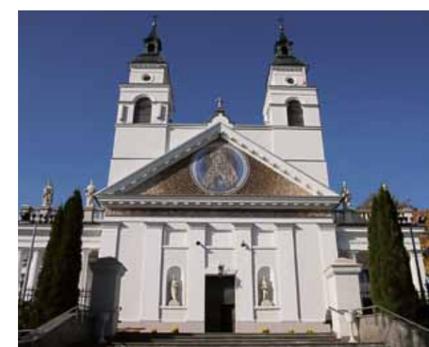
Church dedicated to Saint Anthony in Sokółka