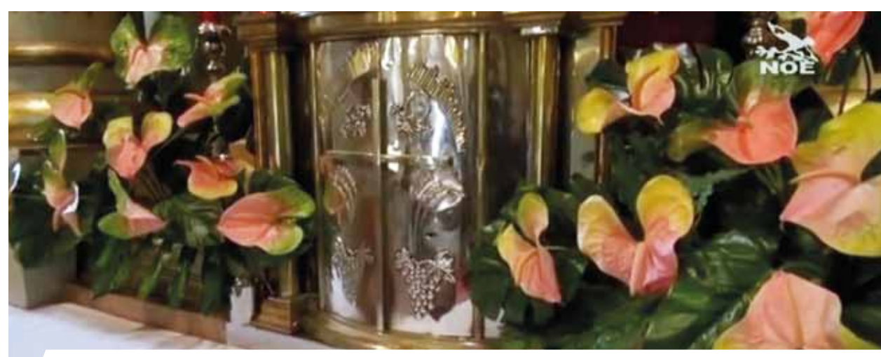
Tabernacle where miraculous Host that fell to the ground was first stored