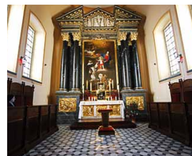
Interior Chapel where the precious Relic is kept