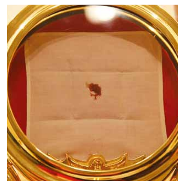
The fragment of the partially dissolved Host with the blood colored substance emanated from its interior is the relic that was placed on the white corporal with an embroidered red cross.