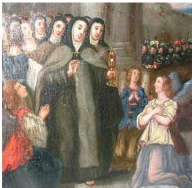
Ancient depiction of the Miracle of Saint Clare