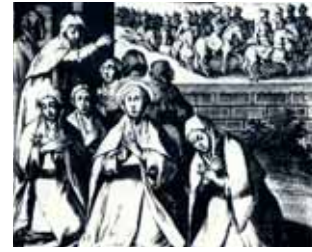
Enrico de Vroom (1587), Miracle of Saint Clare