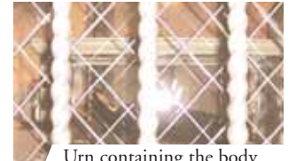
Urn containing the body of Saint Clare, Assisi