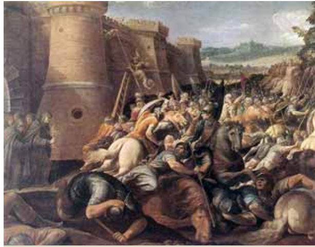
Saint Clare and the Assault on Assisi , Giuseppe Cesari (1568-1640). Hermitage Museum, St. Petersburg

The History of Saint Clare, Virgin , tells of various miracles performed by Saint Clare. There are episodes of multiplications of loaves and of bottles of oil that appeared in the convent when there was none before. But Clare performed the most famous of the miracles in 1240 on a Friday in September, in which she turned away an attack by Saracen soldiers who had broken into the convent cloister by showing them the Sacred Host.