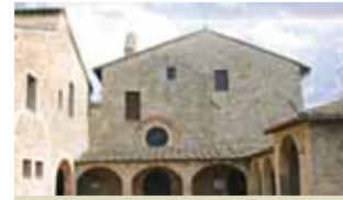
Convent of San Damiano in Assisi