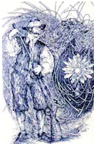
(2) An early print (around the 18th century) depicting the Miracle